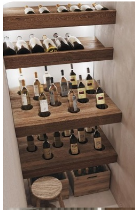
Wine storage /shelving idea