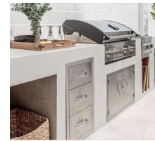
OUTDOOR KITCHEN W/ISLAND PENDANTS