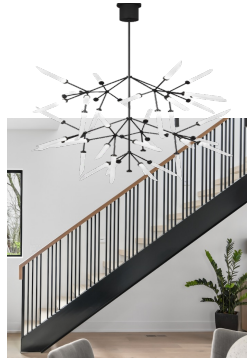
STAIRWELL & FIXTURE