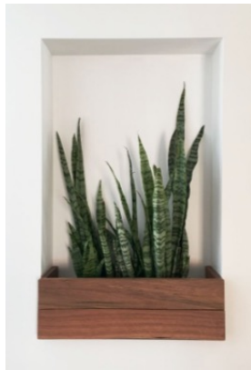
Master bath wall Opposite of vanity X 3