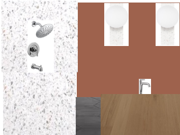
BATH 5 / UPSTAIRS ENSUITE